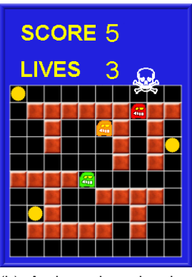
(b) A dynamic animation object.